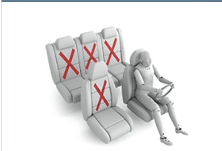
Britax Römer TriFix2 i-Size (i-Size)