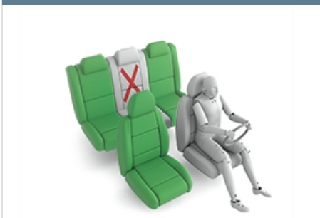
BeSafe iZi Combi X4 ISOfix (ISOFIX)