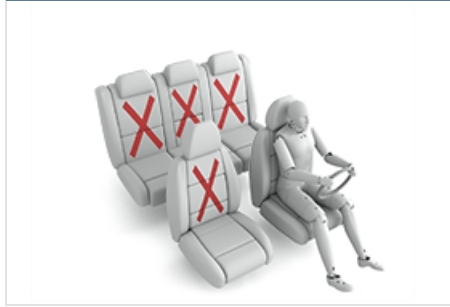
Maxi Cosi 2way Pearl & 2wayFix (i-Size)